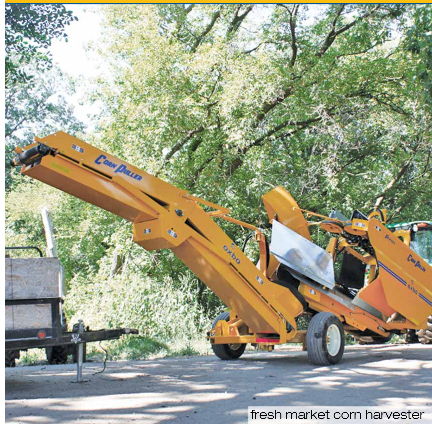
fresh market corn harvester